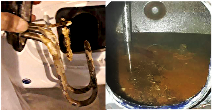
Pictures 5 & 6. 3 weeks after Vulcan installation, initial scale has been eliminated.

Scale gradually disappeared from the elements and reservoir sump. After 3 months scale is entirely gone from water heater elements and the reservoir sump.