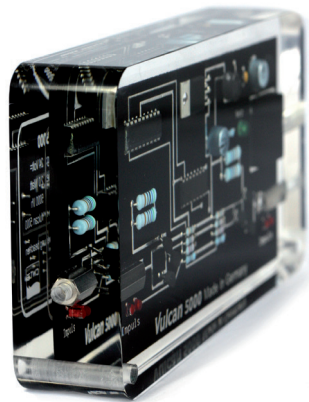
Long-life acrylic cast

Vulcan protects your whole piping system, appliances and equipment from aggressive scale deposits, unnecessary defects and corrosion.